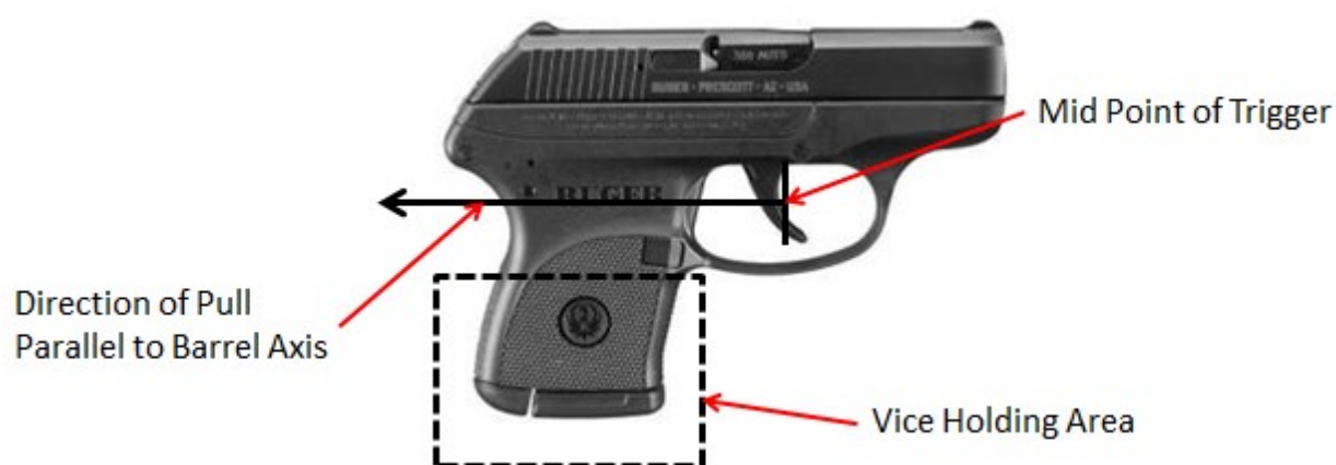
Testing Set Up Diagram

The pistol will be held in a padded vice. Load shall be applied parallel to barrel bore axis in the middle of trigger bar. Measurements for the force at which with trigger breaks shall be recorded. This test is similar to protocols for military test specifications. Tests will be performed with a test scale; gridded camera analysis will be utilized to determine distance (X Axis).